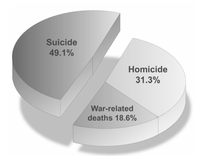
FIGURE 1.2. Suicide Is the Leading Cause of Violent Deaths Worldwide

In the U.S., suicide claims approximately 30,000 lives each year. Overall, suicide was the 11<sup>th</sup> leading cause of death among Americans in 2000.<sup>21</sup> In 1999, more than 152,000 hospital admissions and more than 700,000 visits to hospital emergency rooms were for self-harming behaviors.<sup>22</sup> The vast majority of all people who die by suicide have a mental illness — often undiagnosed or untreated.<sup>21</sup>